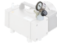
(Pump MPC 301 Z shown with dial gauge 700458)