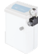
(Pump MPC 105 T shown with dial gauge 700459)